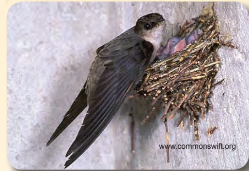
Chimney Swifts historically built their nests in hollow trees. American pioneers cleared forests and the Chimney Swift adapted to the masonry chimneys built by the pioneers.

Visit the Bird Bio-Buggy to learn about birds you may see during the fall migration! Discover about the many different kinds of birds and try to spot some of our feathered friends with binoculars. Hunt around CNC to find out how many different types of nest you can spot!