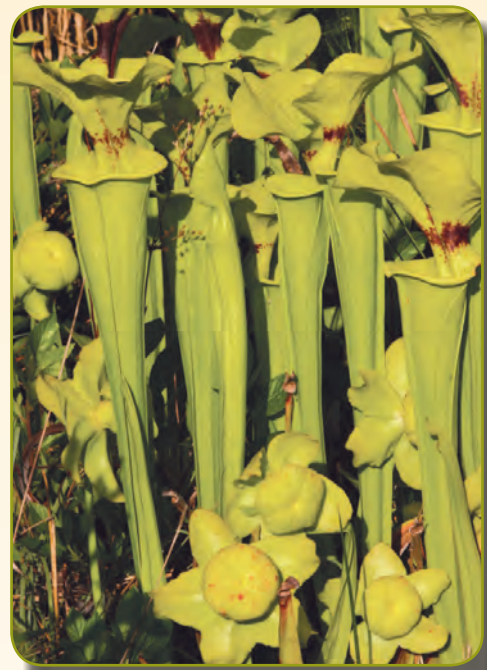
Sarracenia flava Also known as the yellow trumpet pitcher plant - ranges from Virginia to Alabama in coastal wetlands. Come learn with CNC about other neat plants growing in our wetlands!

Saturday September 12, 9am - 12pm $15 non-members/$10 members, Ages 16 to Adult Learn about Wetlands in the Piedmont Region of GA and enjoy an in-depth guided walk of the wetlands at the Chattahoochee Nature Center. Swamps, marshes, bogs, and the plants that thrive in these habitats will be discussed as you explore the CNC Wetlands.