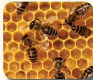
The honeybees' hive has cells made of wax. This is where the queen bee lays her eggs. She can lay up to 1,500 in one day!

Visit the Insect Bio-Buggy to explore the variety of insects that call CNC home! A perfect way to discover these interesting bugs crawling around the gardens and trails at CNC! See if you can spot their homes and different habitats around the grounds!