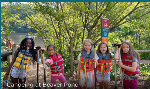
Canoeing at Beaver Pond