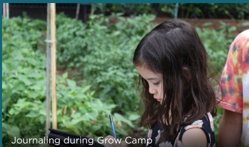
Journaling during Grow Camp