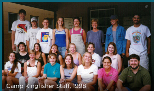
Camp Kingfisher Staff, 1998

In its 30th season, Camp Kingfisher saw close to 300 campers per week, hired approximately 60 seasonal staff members, and changed the lives of 2,000 plus campers with the power of community and nature.