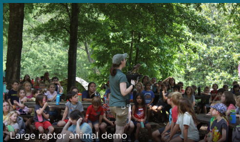
Large raptor animal demo